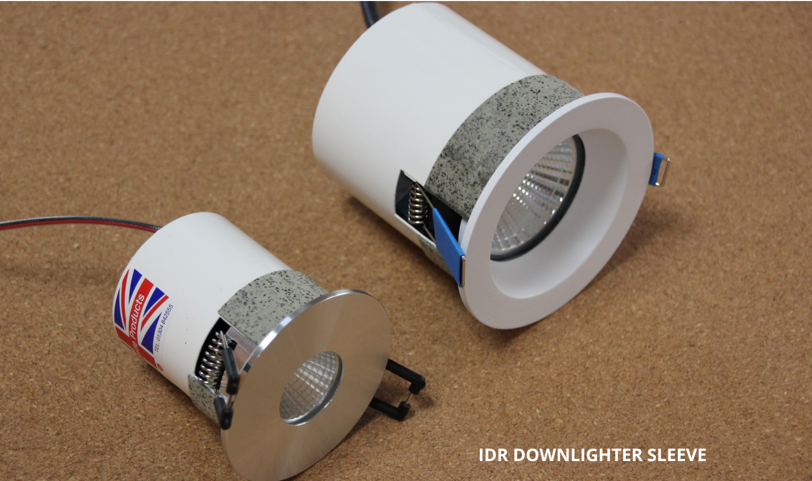
IDR DOWNLIGHTER SLEEVE